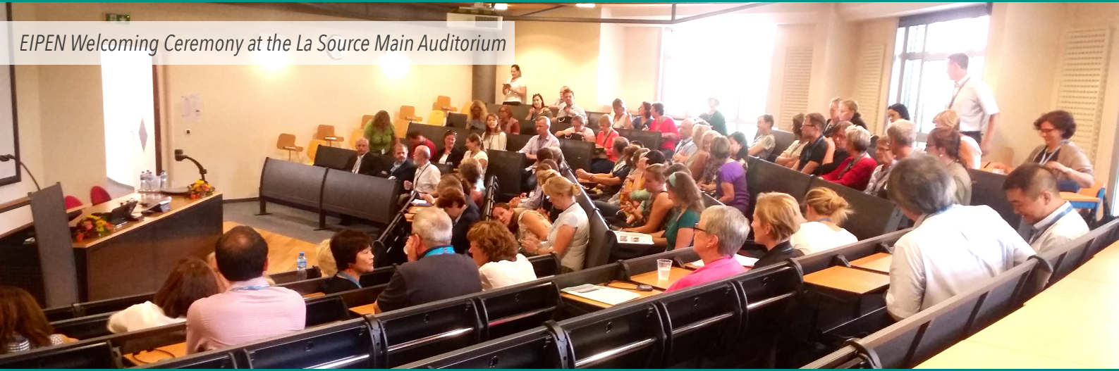
EIPEN Welcoming Ceremony at the La Source Main Auditorium