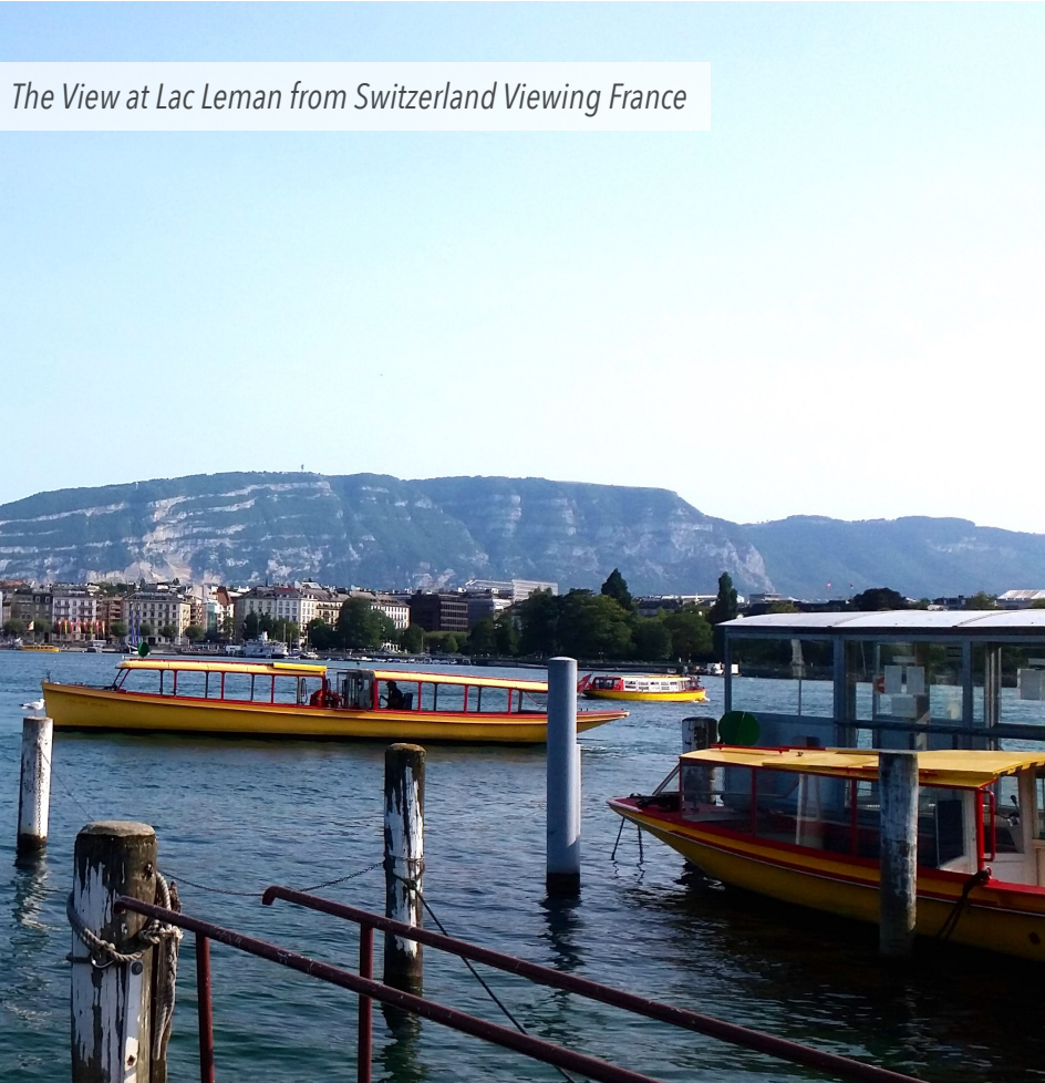
The View at Lac Lemman from Switzerland Viewing France