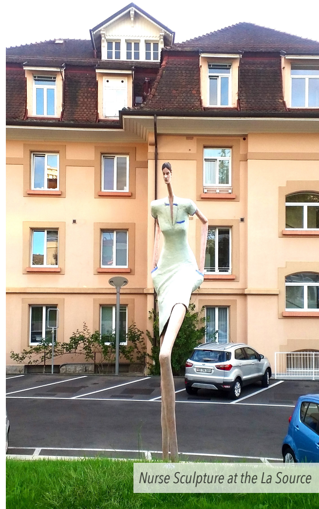
Nurse Sculpture at the La Source

(1) Challenges remain in implementing IPEC within universities and health and social care systems up until today, hence a need to perform more political lobbying to convince policy makers on putting IPEC at the core of health and social care provisions; (2) initiatives in creating a code of ethics for the practice of IPEC are under way, making it a vital competency among professionals; (3) need to be reflective in practicing IPEC; and (4) importance of involving community partners when performing IPEC programs and researches.