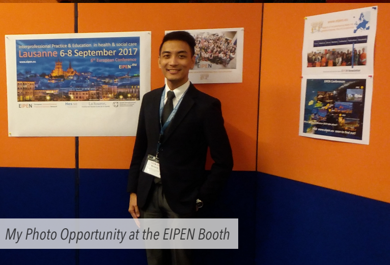
My Photo Opportunity at the EIPEN Booth