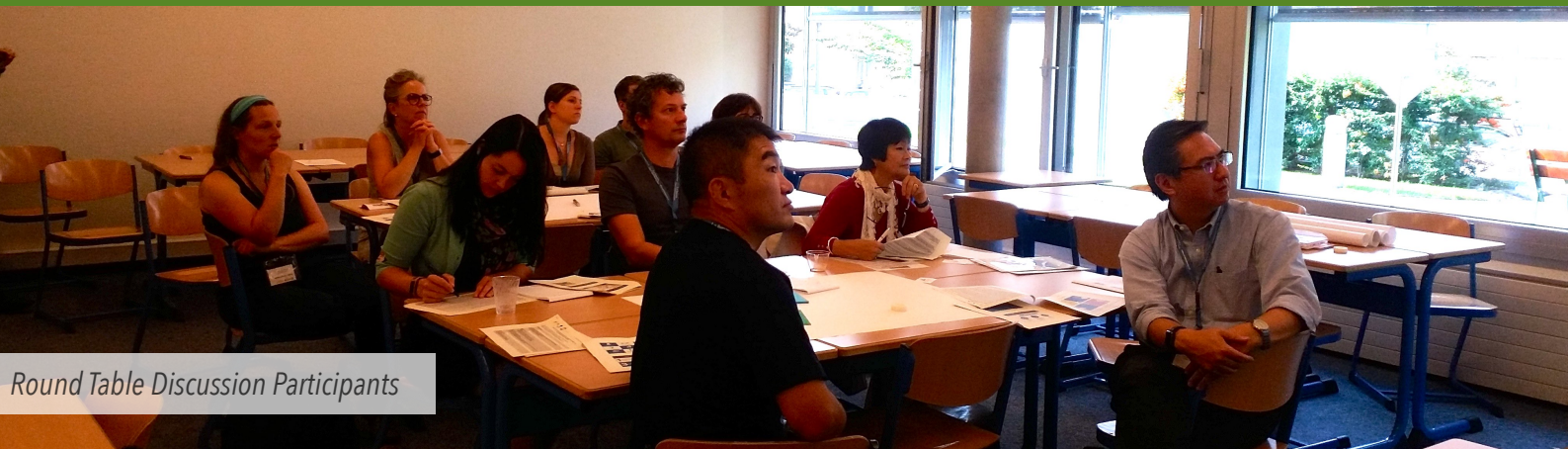
Round Table Discussion Participants