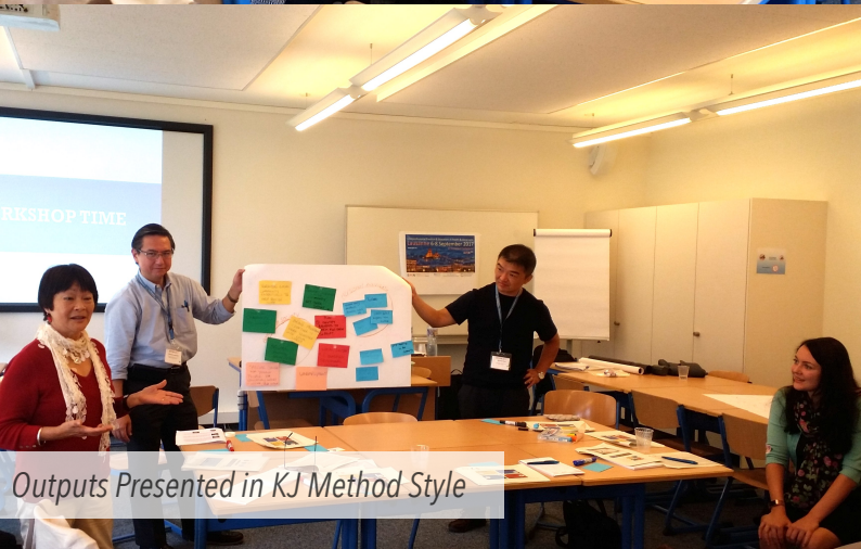
Outputs Presented in KJ Method Style