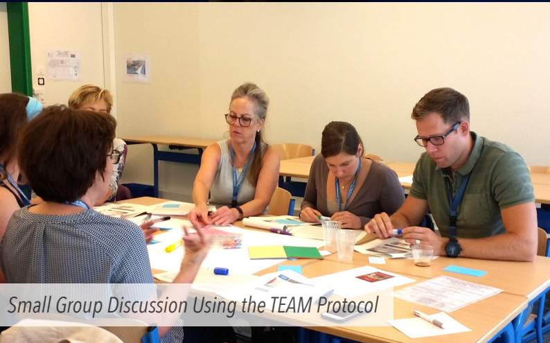
Small Group Discussion Using the TEAM Protocol